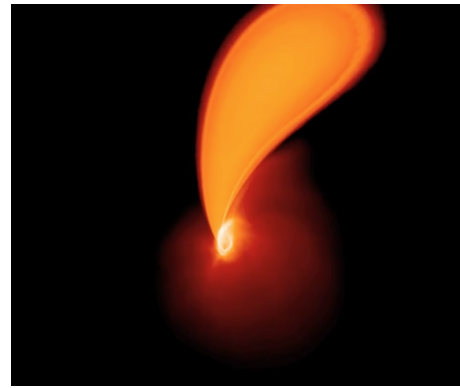
Figure 3: A white dwarf that entered very deeply into the tidal radius of an intermediate mass black hole. The white dwarf has been disrupted and thereby underwent substantial burning. Approximately half of the white dwarf is bound to the black, falling towards it and thereby building up an accretion disk.

a critical distance which is called the “tidal radius”. The deformation of a white dwarf star that passes just outside the tidal radius of an “intermediate mass black hole” with 1000 times the mass of our Sun is shown in Fig. 2 \HLRNref{rosswog09}. In extreme cases where a white dwarf passes very deeply inside the tidal radius, the tidal forces of the black hole can crush the star so strongly that a thermonuclear explosion is triggered. Such a case is shown in Fig. 3 (from \HLRNref{rosswog09}).